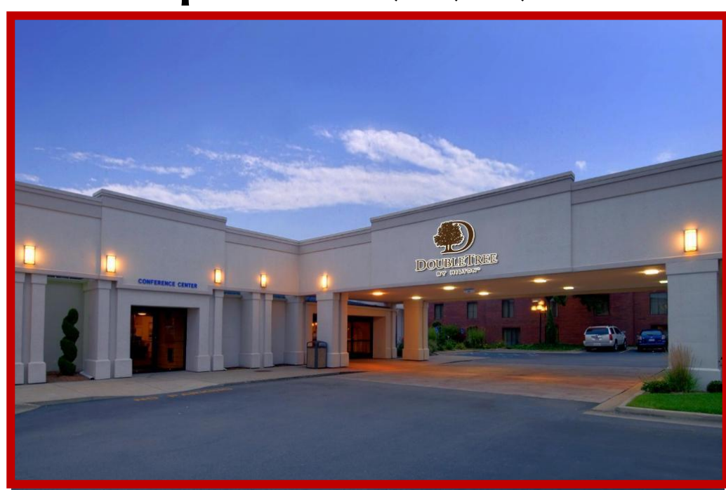
DoubleTree by Hilton at Grand Rapids Airport

4747 28<sup>th</sup> Street SE, Grand Rapids, Michigan 49512